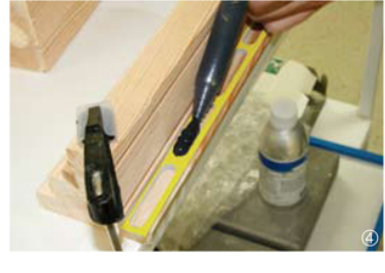
Removing excess adhesive with a spatula.Avoid compression of the tape when removing excess adhesive, so that the necessary adhesive layer in the blankings does not fall below the limit.