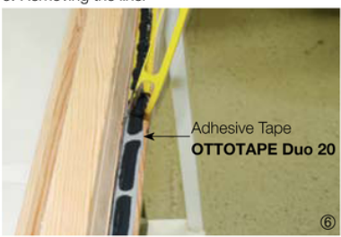
8. Mounting the insulating glass pane. Apply the insulating glass and fix it with a slight and even pressure on the tape in order to ensure a permanent contact between the glass pane and the